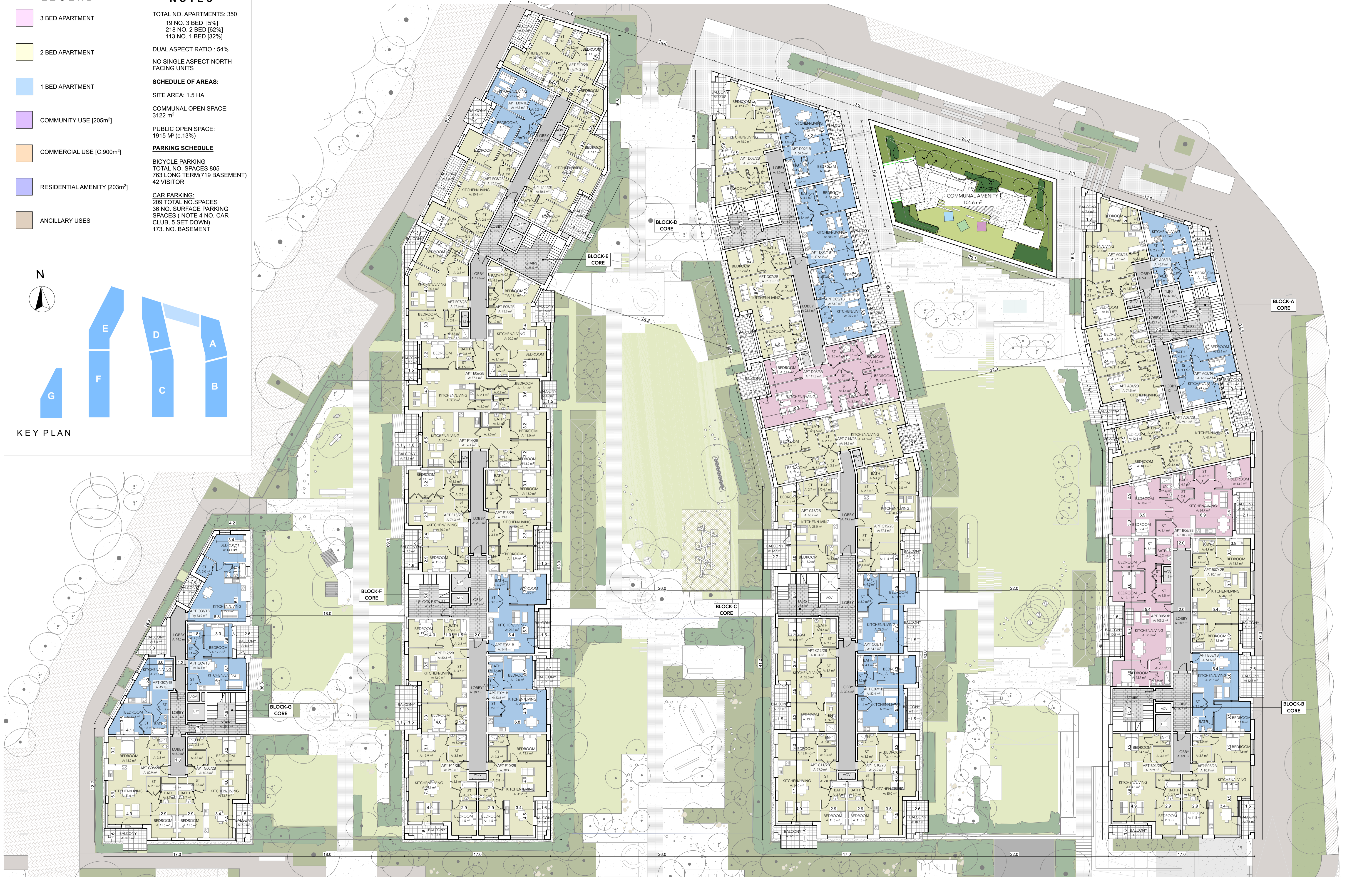
First Floor Plan SCALE: 1:200